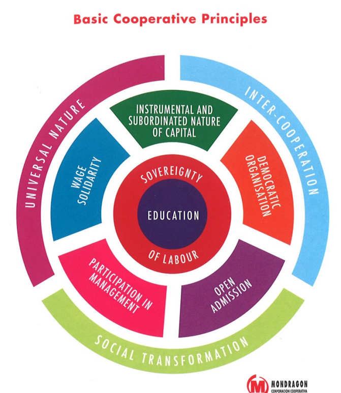
The Mondragón University System

We have the capacity of being peaceful and respectful and an educational system that teaches the principles of conflict resolution and human rights at a young age is preparing a generation of people capable of handling conflicts maturely.